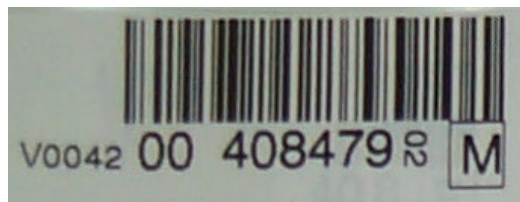
Figure 2 Numeric Presentation

When printed as a two-digit number the digits should be rotated 90° clockwise to make them visually different from the other data characters in the Donation Identification Number. An example is shown in Figure 2 .