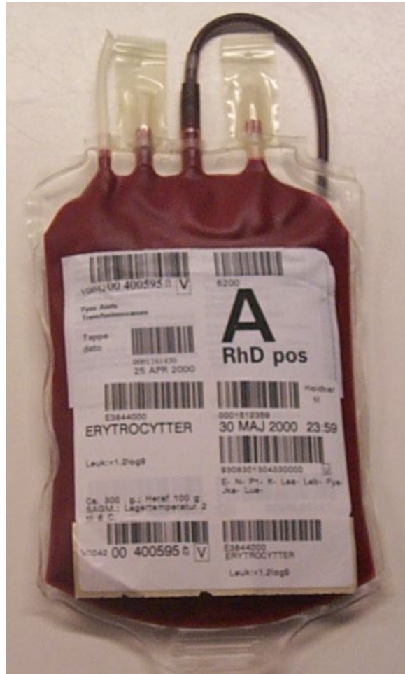
Figure 4 Scandinavian Blood Label