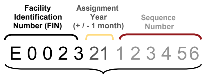
Donation Identification Number (DIN)

Because the first five characters of an ISBT 128 DIN identify the facility that collected (or pooled) the product, the DIN may be used as the first step in tracing the product back to the facility that collected it.